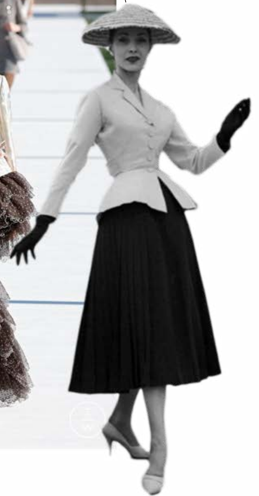
Christian Dior "Junon" dress Fall/Winter 1949-50 haute couture