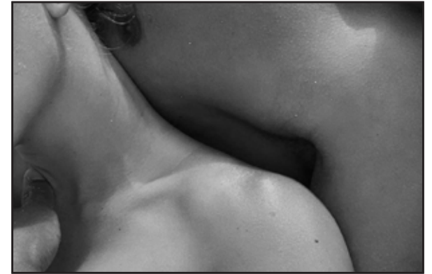
in each breath