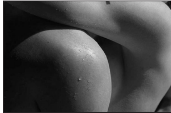
to find the middle