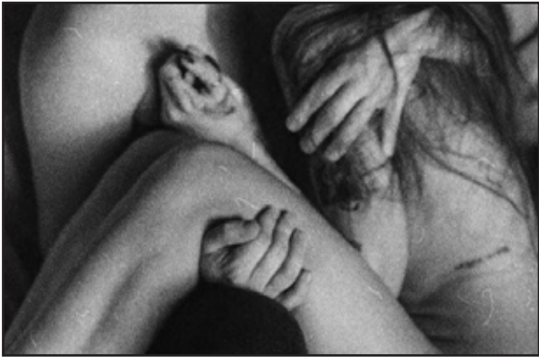
yet drawn together