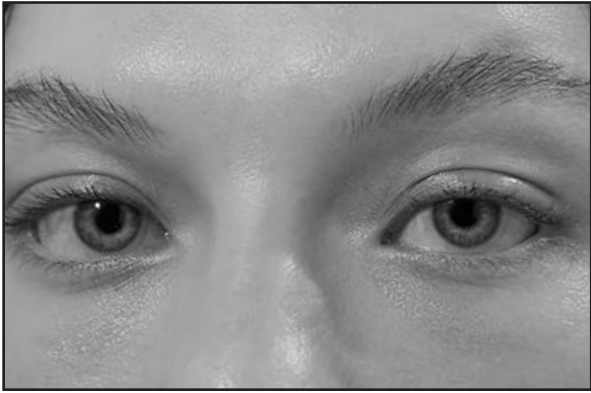
we are friends