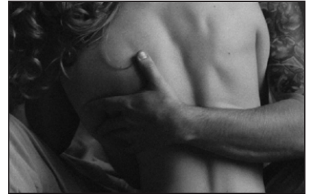
not the same