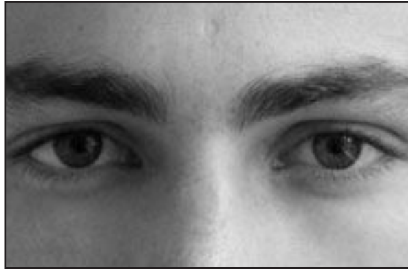
we are lovers